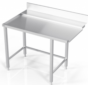
TABLE TO DISHWASHER WITH FRAME (PX0-PRO)